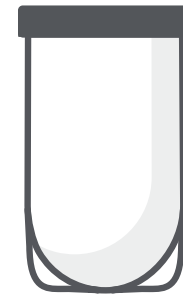
tall cup with lip ring