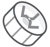
stainless steel cross blade