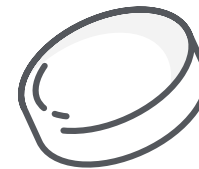
stay-fresh resealable lid