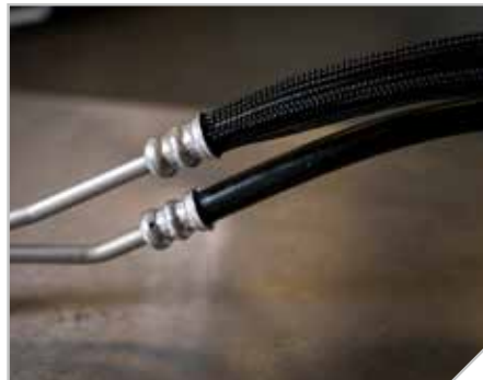
Example part: 624-628 Jeep Wrangler 2018-12