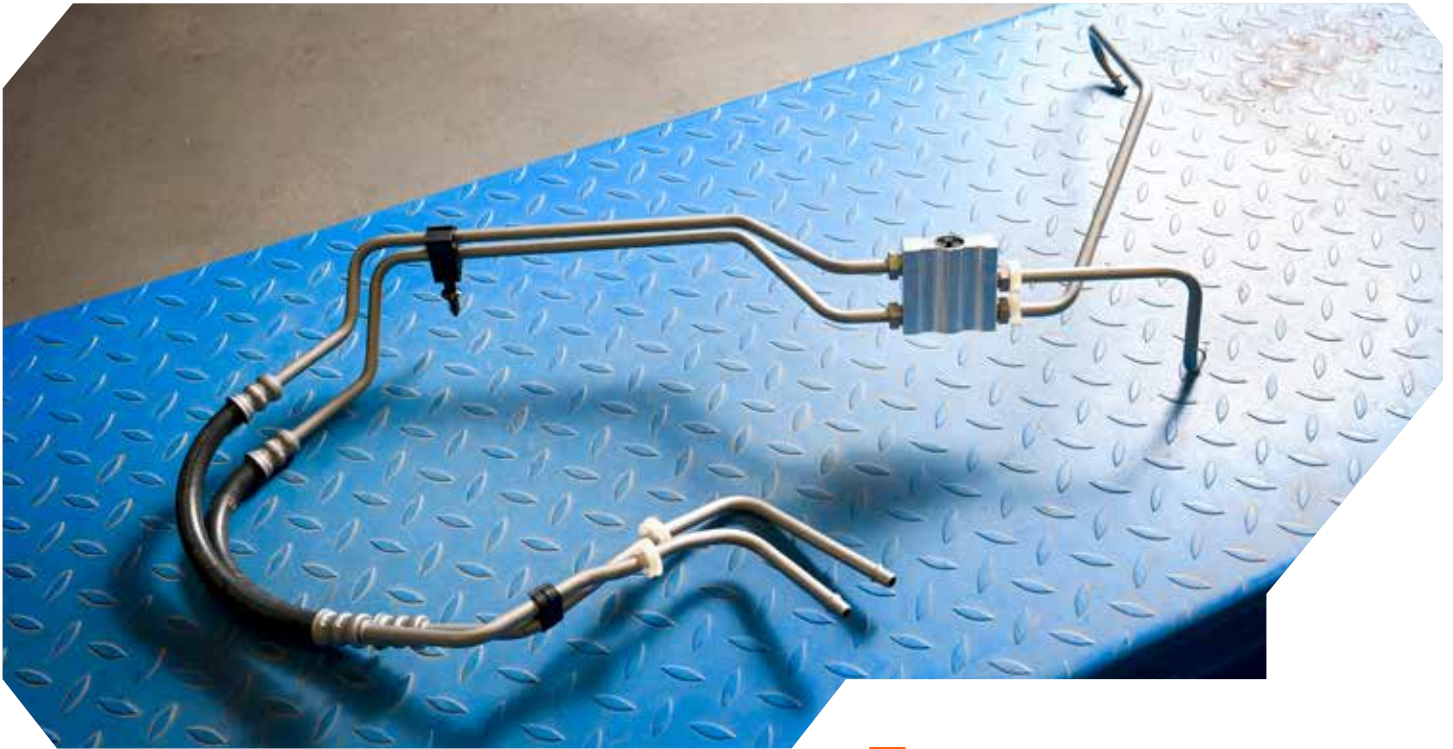
Example part: 624-625 Dodge Durango 2013-11, Jeep Grand Cherokee 2013-11